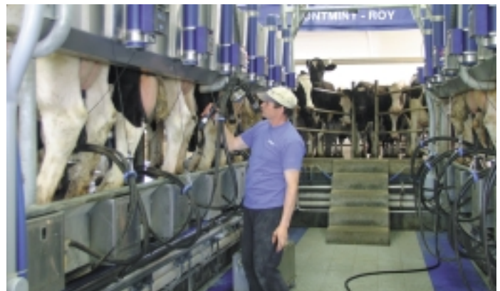
The Cascade parallel parlor includes features you need to safely milk your cows, including an Air Powered Index System for correct cow positioning.