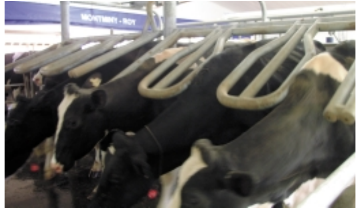
With ALL-EXIT™ for efficient release, you can release all cows in one group.

The components of the Cascade parallel parlor are cut to fit, and welded on site for extra strength. The hot-dipped galvanized steel components are extremely durable and there are no steel-to-steel wear points, assuring you years of uninterrupted service.